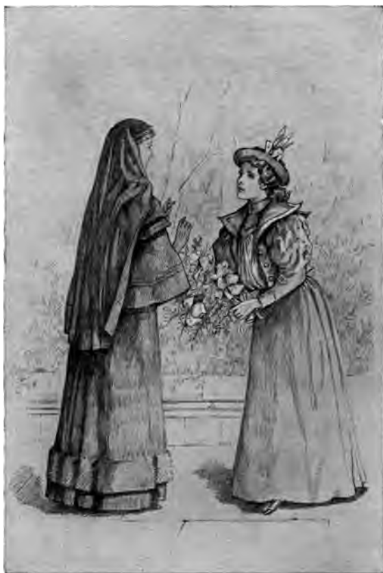
THE LADY IN BLACK